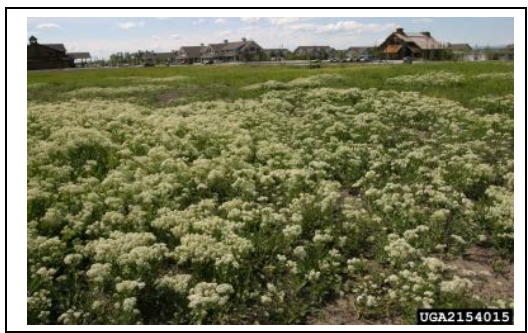
Whitetop can quickly fill in abandoned lots forming near monocultures.

containment or eradication where less abundant. All